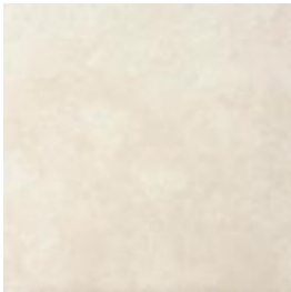
Ivory Marble Marble and its construction by-products