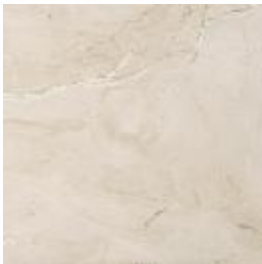
Fantasy Crema Marble Marble and its construction by-products