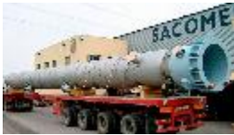
Pressure Vessels and Process Tanks Industrial machinery in general