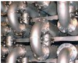
Industrial Tube in Tube Heat Exchanger. Non removable inner tube I-TF20-I