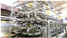
Food Process Plants