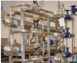
V SERIES Water Heaters Heat exchangers