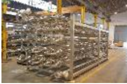
Multitube Sanitary Heat Exchanger with non removable tube bundle. S-TFM-I