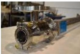
Annular Space Heat Exchanger with Axial Product Inlet S-TF40A-D