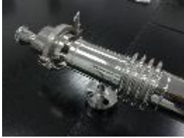
Pharmaceutical Multitube Heat Exchanger with Double Tubesheet Machinery for the chemical and pharmaceutical industry in general