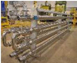
Annular Space Heat Exchanger with Radial Product Inlet S-TF40R-D