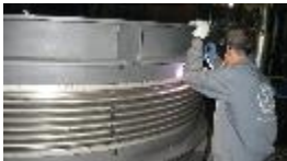
Metal Expansion Joints and Metallic Compensators Compensators