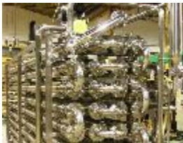
Sanitary Tube in Tube Heat Exchanger S-TF20-I. Non removable inner tube.