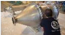
Industrial Multitube Heat Exchanger with non removable tube bundle. I-TFM-I